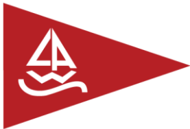
Lake Winnepesaukee Sailing Association